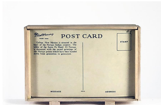
Erinn Kathryn, "Heart of the Navajo Indian Country" (Gallup, NM)/2019/Handmade box, 3 panes of glass, screen print, vintage postcard/3.5" x 5.5" x 1.5"